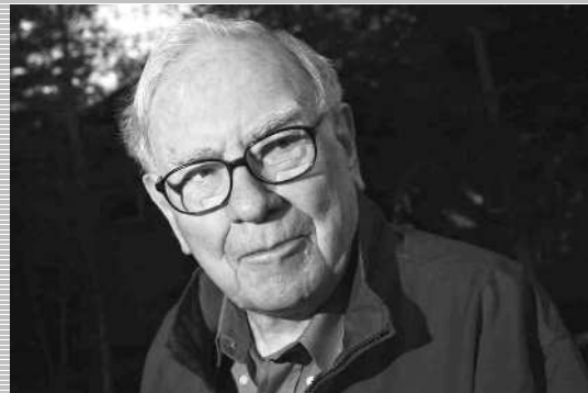
Warren Buffett/Major Shareholder